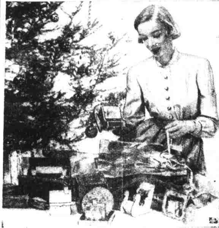
SCENTIBLE YULETIDE . . . Merry young fragrance in Yankee clover or violet scents are beautifully packaged in a dream house, sleigh or magic lantern for good gifts.