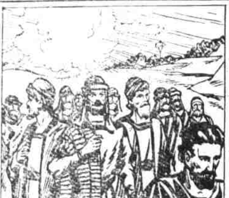
Forty days after His resurrection, while - Jesus teld the disciples to stay in Jerutailing with his disciples, Jesus "was colem until they received the Holy 12" I then to go preach- "unto the netering transfer of the earth."

The service wild at the late the cash Wednesday during January