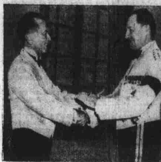
FIELD MARSHAL in the Philippines Army, he is congratulated by Quezon.