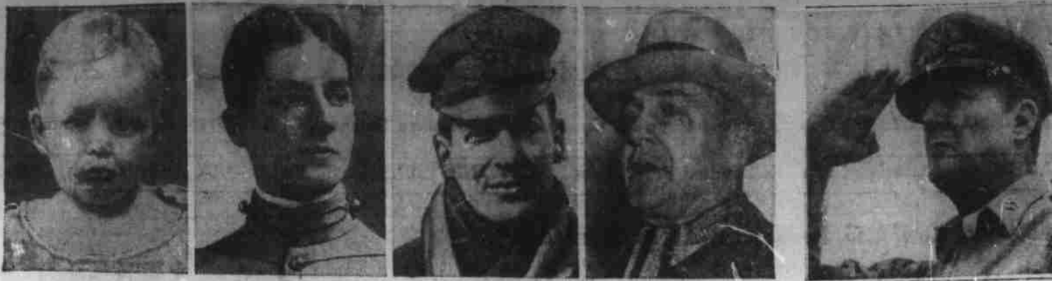
AS A BABY he had an earnest look. AT WEST POINT he finished in 1903. IN WORLD WAR I he was a brigadier. IN 1937 he visited the White House. REVIEWING his troops in Tokyo on July 4, 1947.