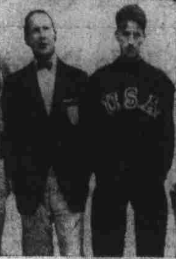
MacARTHUR, left, was Olympic chairman in 1928.