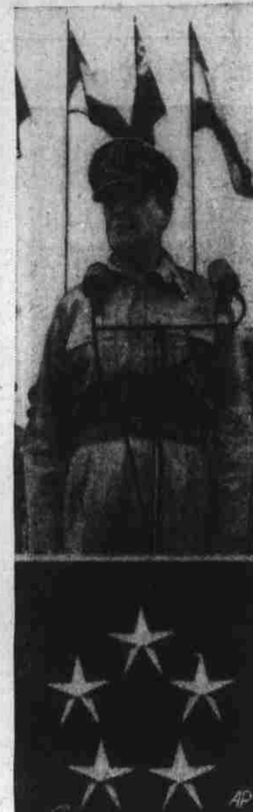
ON THE JOB in Tokyo—he personifies authority.