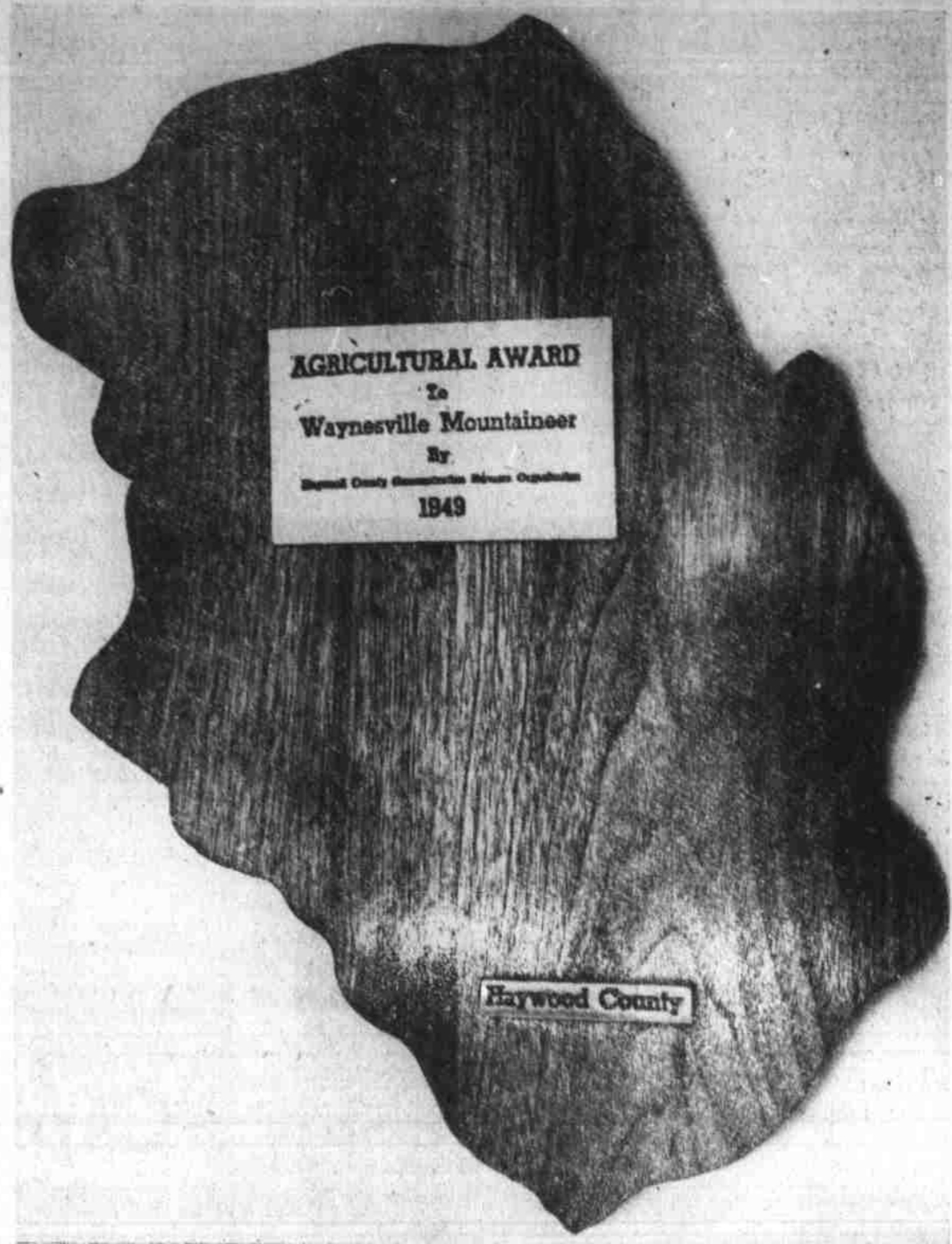
This is a beautiful butternut placque, in the shape of Haywood County, as awarded this newspaper by the Haywood County Demonstration farmers last week. The award is in recognition of cooperation in their program.