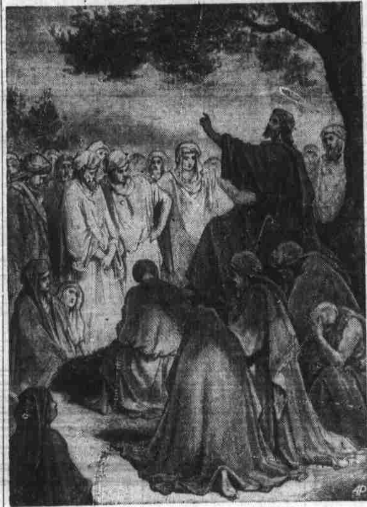
A PRINT from Dore's painting of Christ preaching.