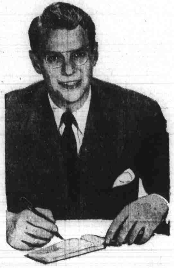
A Combination of Experience Plus Talents In Preparing Copy—At No Extra Cost To You.