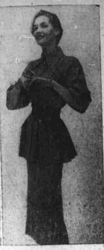
Eisenberg molds sheer wool into a 2-piece ensemble. The fullness of the jacket is cinched at the waist by a wide snakeskin belt.