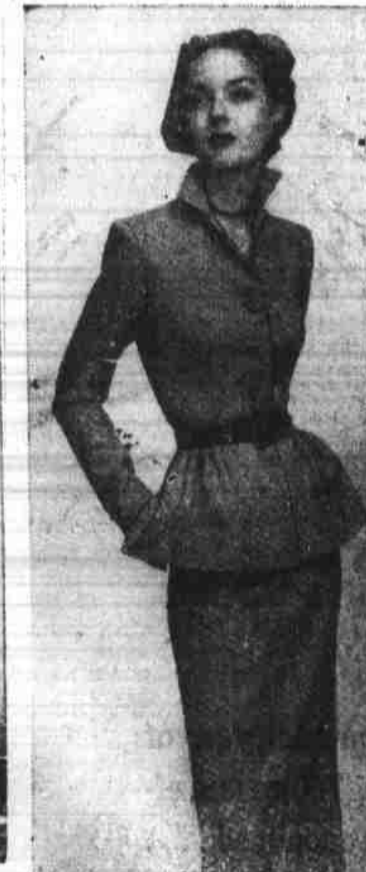
A Paris-inspired Spring frock of highly-styled, finely checked tweed with subtle texture interest by Milridge Woolens.