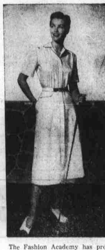
The Fashion Academy has presented its annual Gold Award to the Serbin Company for this classic golfer dress of Lonsdale Cotton.