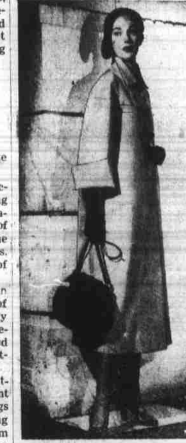
Parchment Imperial Gabardine by Miron makes this important coat with dropped shoulders emphasized by the yoke which crosses the sleeves and chest.