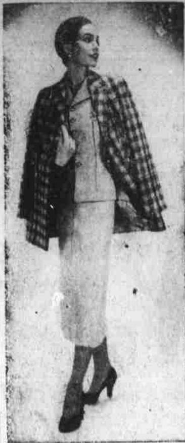
Imported wool in a classic suit with designer touches that soften the simple lines as designed by Stefan of Linker & Herbert.