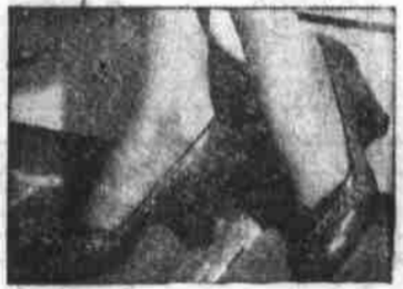
The Spring 1950 version of a favorite classic in a soft tone red calf spectator pump designed by Johansen.