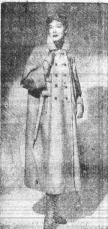
This imported linen raincoat by Lawrence of London can easily double as a Spring coat. B.G.E. buttons trim the garment.

Egypt was once one of the first Christian countries, but its people are now predominantly Moslem.