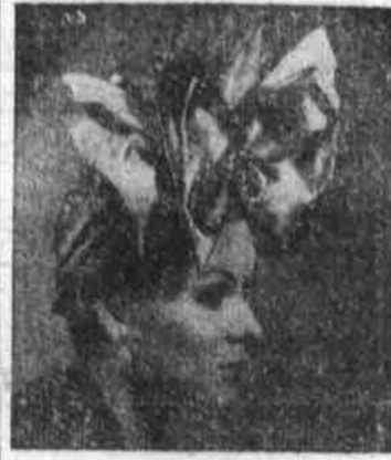
A forward-moving elliptical sailor of pearly mauve straw is designed by Sally Victor. It is trimmed with a cluster of satin bows.