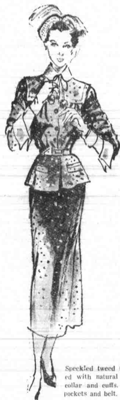
Speckled tweed touched with natural linen collar and cuffs. Slot pockets and belt.

The synonym for Spring in the language of fashion is a new coat and a new suit. Our new Spring collection was garnered with an eye to what you want—and want to pay. The advanced, yet modified styling assures you seasons of fashionable wear. A wide range of junior, misses' and women's sizes.