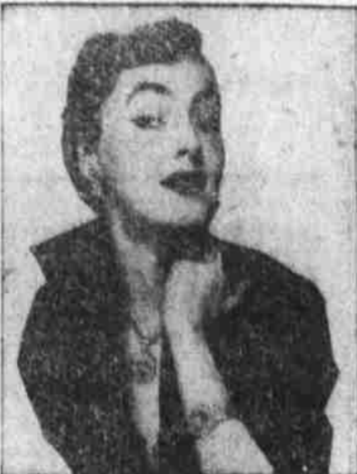
Mid-century version of Victorian jewelry by Coro, quaint medallions paved in seed pearls, the center a gleaming solitaire aquamarine.