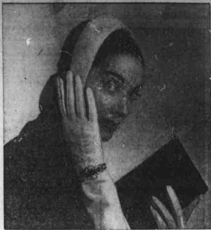
For Spring '50—accessories in the finest of leathers set an elegant mood for the cocktail hour. Long, washable, hand-sewn doeskin gloves by Kislav reflect the fashion influence of the twenties. Trifari's jewelry which is opulent enough to be real completes the costume.