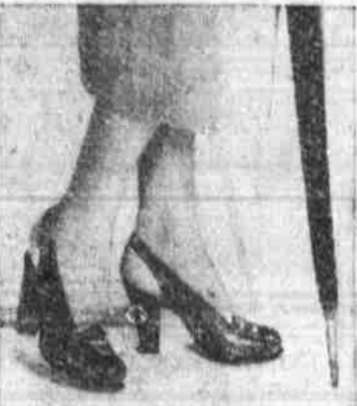
An open-up shoe designed by I. Miller for wear with suits and tweeds. Punchwork cutouts and wall toes are important details.