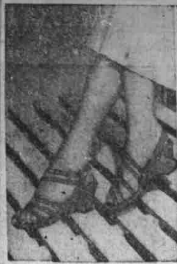
This cool shoe by Town and Country in the new nylon shantung has a high-shaped wedge, platform sole and asymmetric strapping.