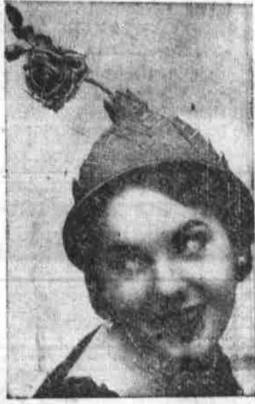
Emme designs a peaked bonnet of emerald grosgrain. A pink silk rose soars high from the tip of the tiered "artichoke" crown.