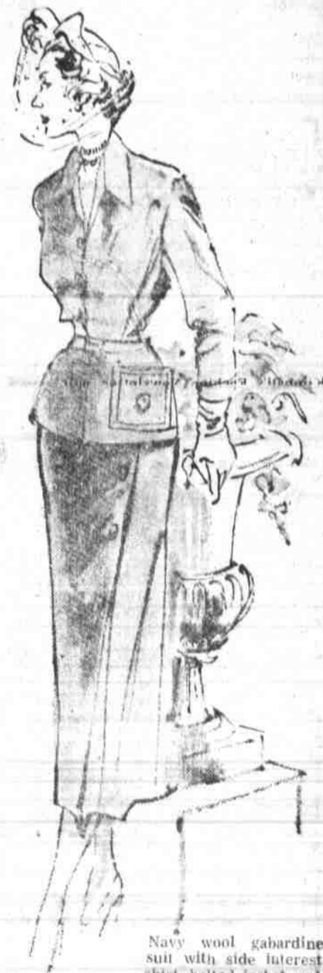
Navy wool gabardine suit with side interest skirt, belted jacket and button accents.