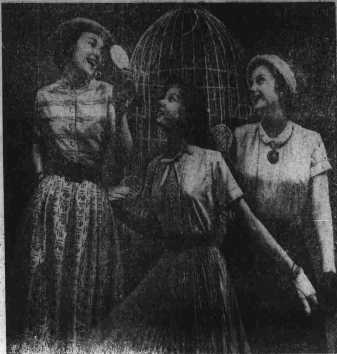
SHIP 'N SHORE . . . These blouses will be equally at home with your Easter suit or on deck with your sailing blues. All are made of fine cotton broadcloth in white or pastels, tucked, tailored and finished to a T, at a penny-bank price.