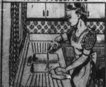
Laundry bleach will whiten kitchen sink. Pour on wet porcelain, then rinse well.