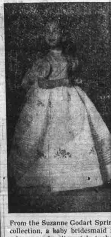
From the Suzanne Godart Spring collection, a baby bridesmaid in crisp organza, alternately tucked and hand-painted with rosebuds.