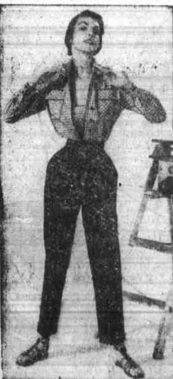
Tapered and peg topped broadcloth slacks designed by Frances Sider. The shirt and bra are of checked tablecloth cotton.