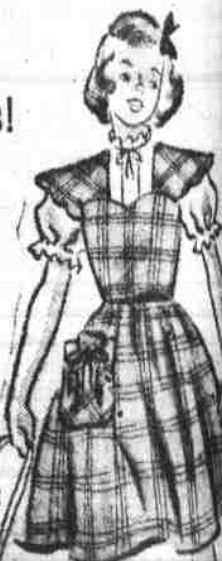
Woven plaid jumper. Ruffled blouse.