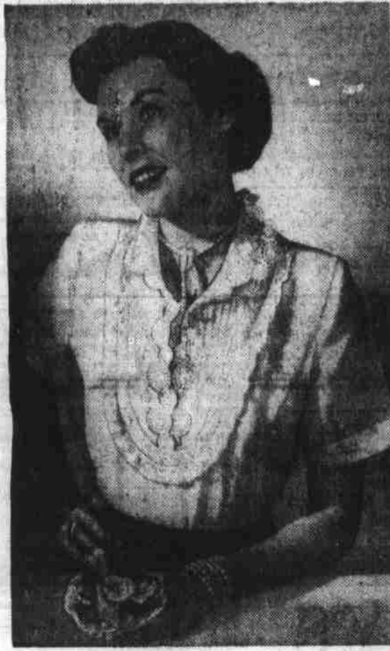
THAT LINGERIE TOUCH . . . It's important news in the spring fashion picture. The dainty blouse at left is of fine batiste with embroidered yoke bordered in Val lace. At right, nylon crepe and lace with casual collar. Both by Weber.