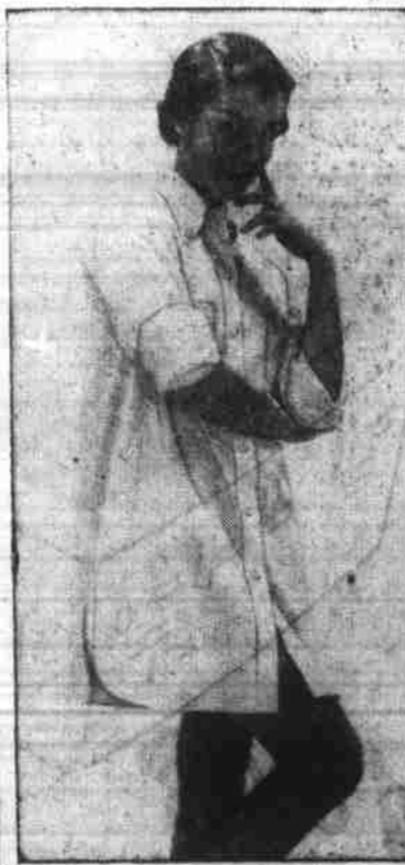
A smart fabric in lined check gives fashion appeal to this handsome suit. It is made of Avisco rayon blended with wool.