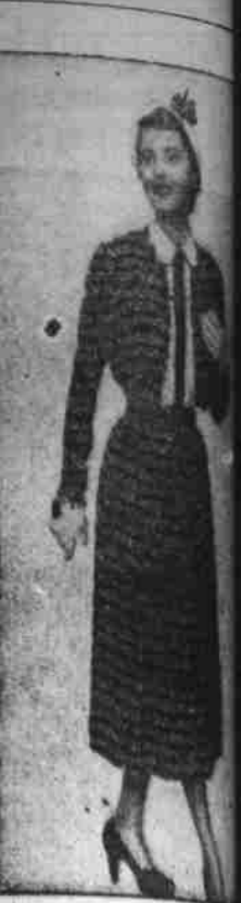
Smart design and Avisco print combine to make young-hearted dress matching bulero jacket.

Paying a fine for overtime parking in Seymour, Ind., a woman surprised police by adding a $10 tip.