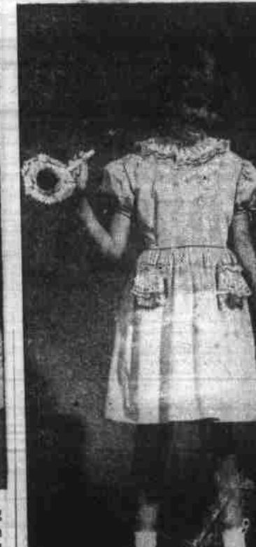
Harlequin's ruff is high fashion for a little party girl's dress by Celeste Frocks. Of pin-tucked batiste edged with Val lace.