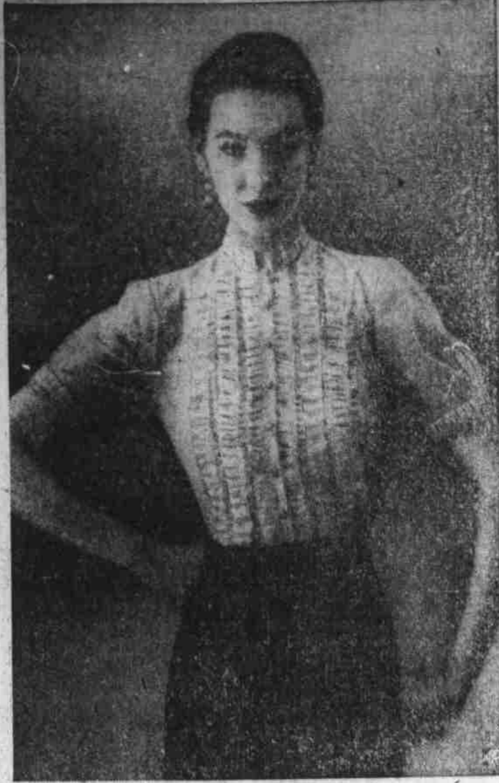
NYLON — NATCH! No girl's spring wardrobe is going to be complete this year without at least one nylon blouse, which she can whisk out in the wash bowl at night and wear without ironing next morning. This one is of sheer nylon tricot shirred in vertical bands and combined with nylon net for one of the daintiest suit mates of the season. It is designed by Yolande.