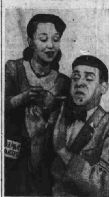
SULPHUR & MOLASSES

IT'S SPRING! This delightful season not only turns your men's fancies to thoughts of love. Here comedian Ish Kabibble of the Kay Kyser television show demonstrates some other typical springtime escapades.