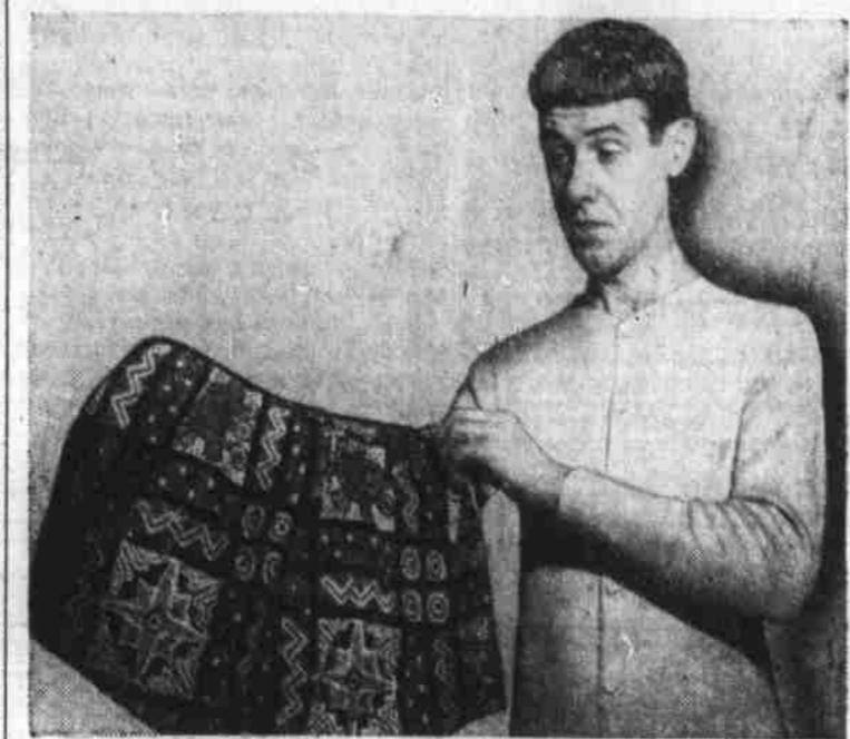
LONGIES vs. SHORTIES