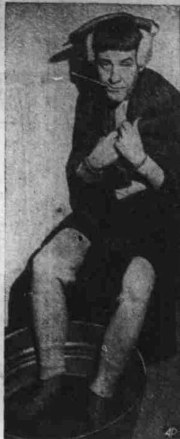
HOT & COLD WARFARE