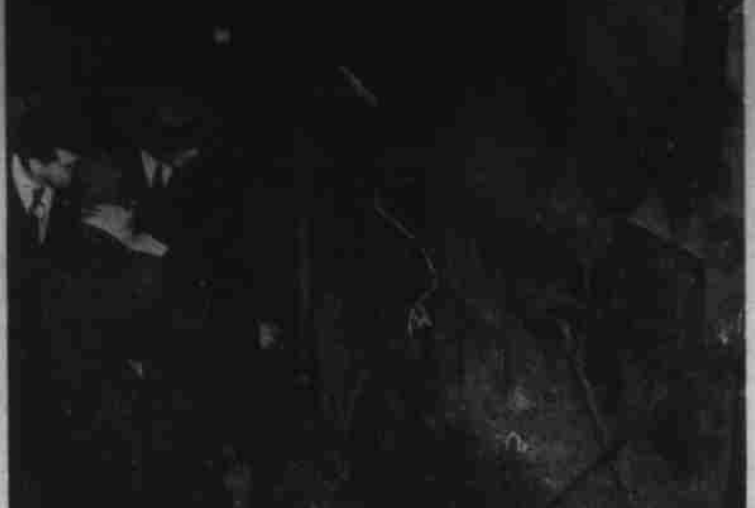
REPORTERS EXAMINE the spot where a boiler tube blew out in a New York steam plant, killing four men who were checking meters. The company produces live steam, which is sent through underground pipes throughout Manhattan for heating and commercial use.

Switching in Bed "It is certain," he continues, that Church Ales easily degener- stop to that, but the custom sur- Sunday and claim the privilege ups in rising on Easter ated into brawls and for this reason vived among the people. In many of lifting every woman three times But apparently a good were ordered out of the church it- parts of Europe parents and chil- from the ground. In payment for