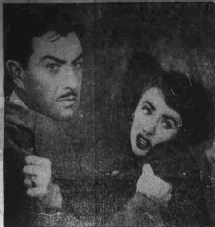
Elizabeth Taylor attempts to escape from the husband whom she suspects is trying to murder her in a thrill sequence from M-G-M's new suspense-drama "Conspirator," which opens at the Park Theatre Thursday. Filmed against authentic backgrounds in England, the new offering marks a peak in the meteoric career of the lovely Miss Taylor who now plays her first mature emotional role.