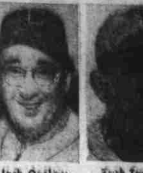
The Eight National League Teams Will Be Under the Direction of These Managers.