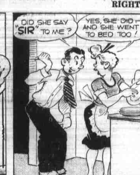
RIGHT AROUND HOME