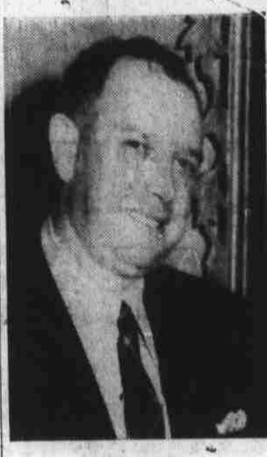
HE HAS YOUR CHILD'S INTEREST AT HEART