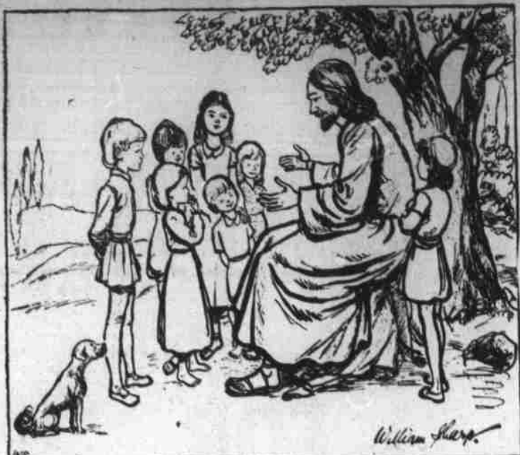
WHAT DOES THIS PICTURE REPRESENT? ANSWER ON PAGE 5