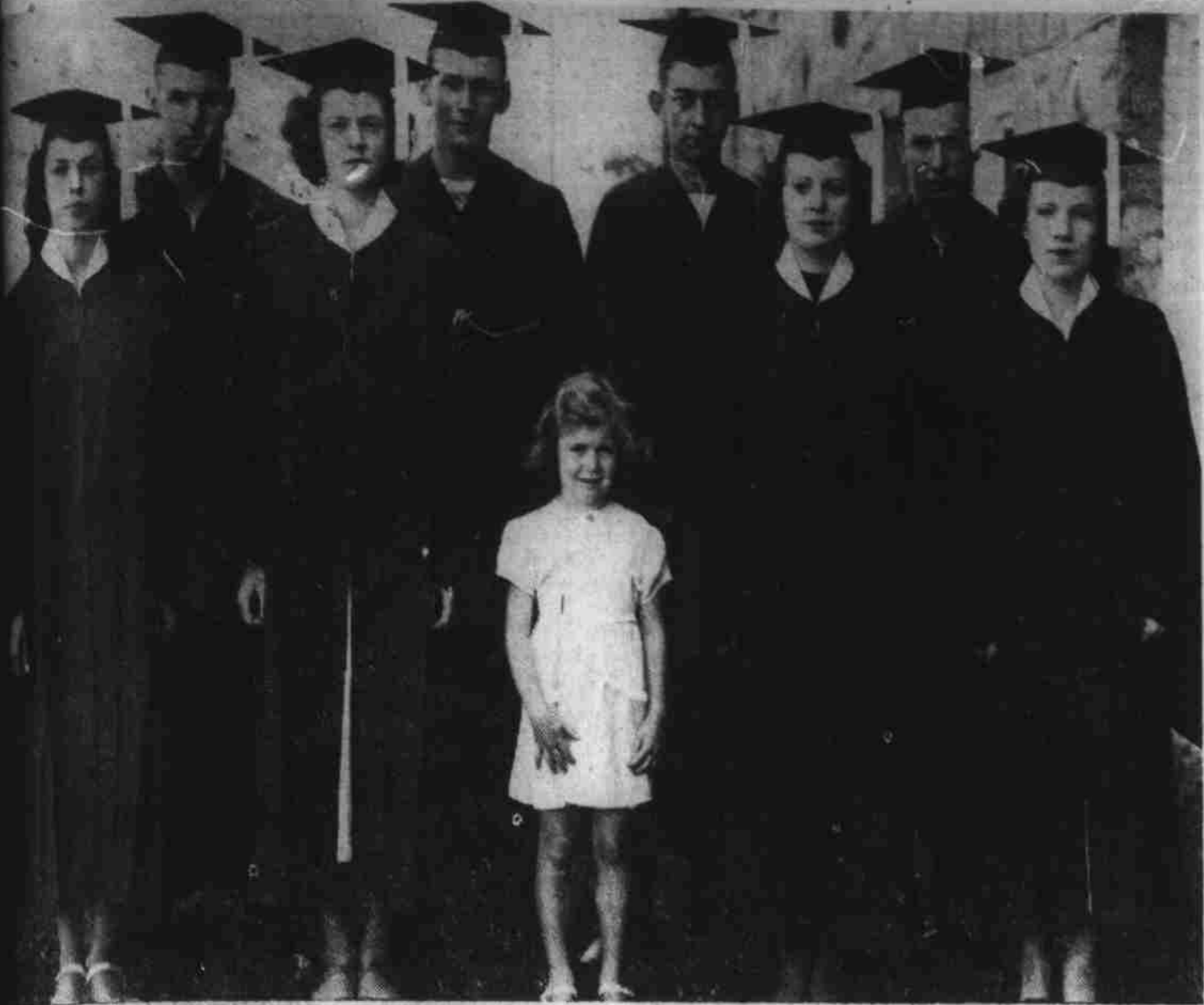
This is the 1950 graduating class of Fines Creek High School. They received their diplomas Wednesday night.