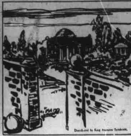
These wealthy, but idolatrous people, should not long enjoy their luxuries, Zephaniah prophesied, but their houses would become a desolation.