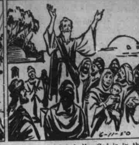
"Fear not; Jehovah thy God is in the midst of thee, a mighty one who will save," Zephaniah promised. MEMORY VERSE—Psalms 86:5.