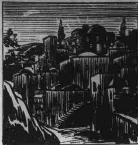
The Lord said that He would search Jerusalem with lamps, and punish those that were living in luxury, indifferent to Jehovah, said Zephaniah.