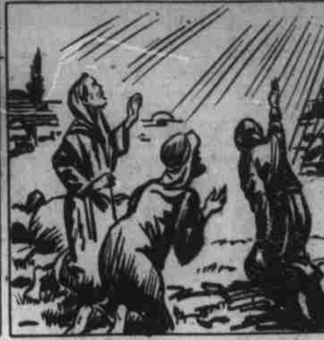
"Seek ye Jehovah, all ye meek of the earth, that have kept His ordinances: it may be ye will be hid in the day of Jehovah's anger."