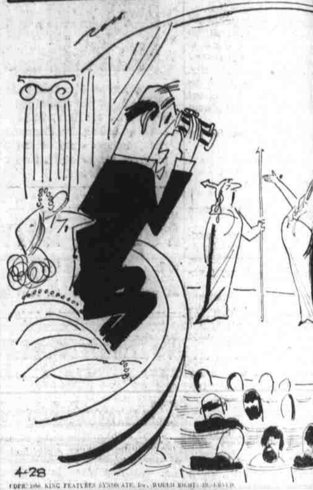
"Her tonsils look inflamed!"