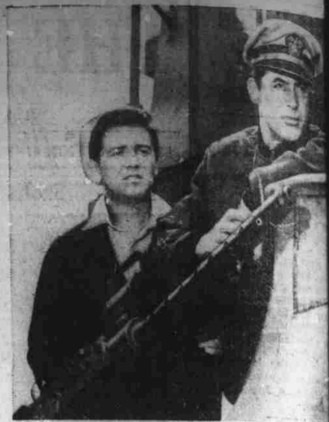
Cary Grant and John Garfield on board the submarine "C.S.," in a scene from "Destination Tokyo," Warner Bros. drama. Coming to the Strand Theatre Thursday and Friday.