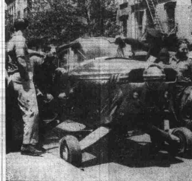
IT WAS SOMETHING NEW to a New York traffic cop, but it was parked in a restricted area of mid-Manhattan, and hence rated a tag.