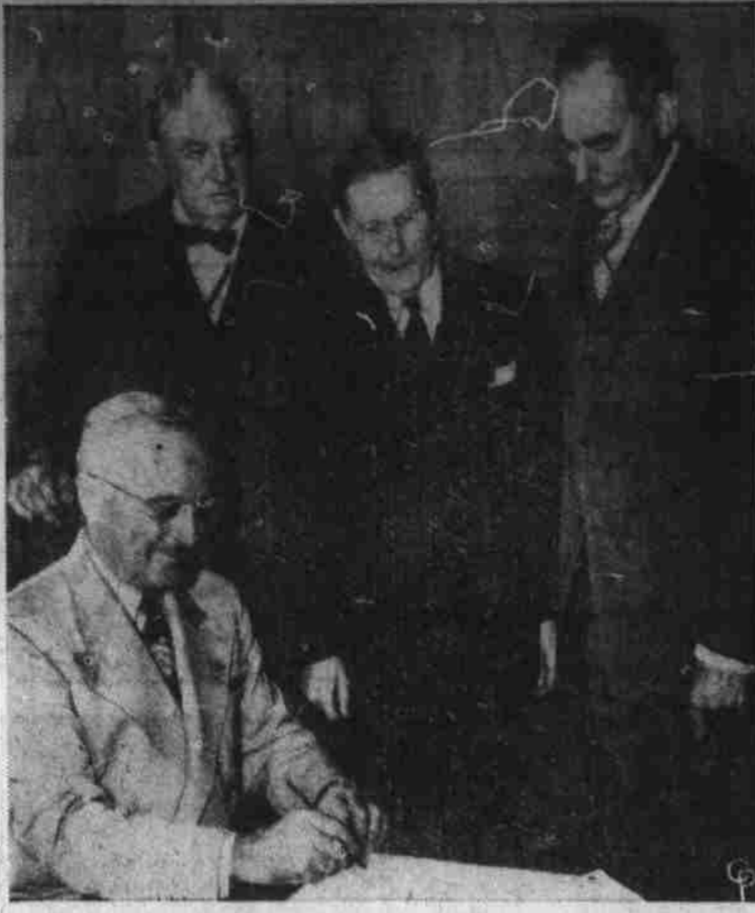
THE OMNIBUS FOREIGN AID bill calling for $3,248,450,000, which President Truman has called a major step toward peace, is signed by the Chief Executive at a White House ceremony in Washington.