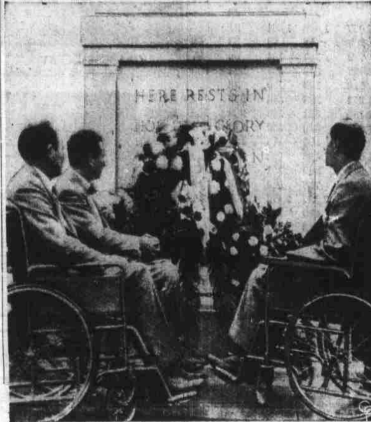
THREE WHEELCHAIR veterans visit the Tomb of the Unknown Soldier in Arlington, Va., National Cemetery in observance of Memorial Day.