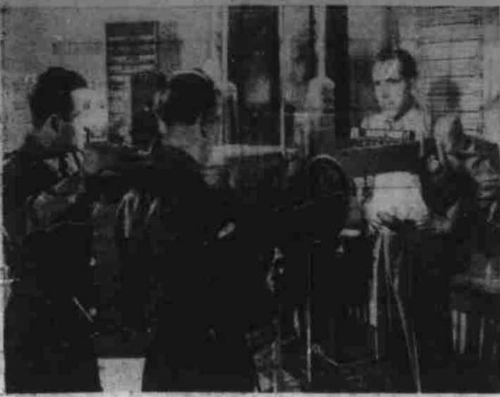
Humphrey Bogart changes his name for a number in this scene from his latest thriller, "Tokyo Joe."