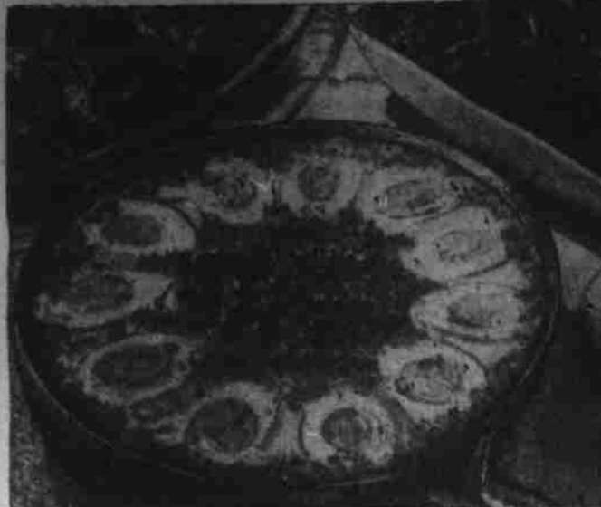
EGG AND CHEESE... Savory summer casserole.

By CECILY BROWNSTONE Associated Press Food Editor