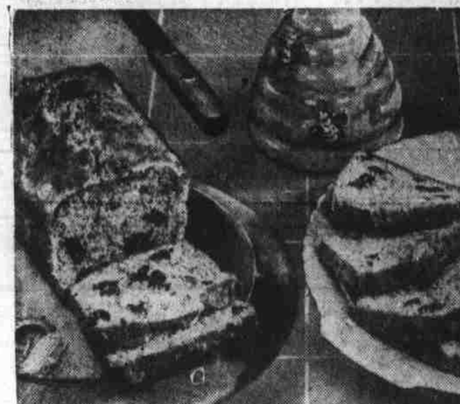
BRAN DATE BREAD... For hearty appetites.

Ingredients: 1/2 cup finely cut dates, 1/2 cup ready-to-eat bran, 1/3 cup hot water, 1 tablespoon butter or margarine, 1/3 cup sugar, 1 egg, 3/4 cup sifted all-purpose flour, 1 1/2 teaspoons baking soda, 1/2 teaspoon salt, 1/2 teaspoon cinnamon, 1/4 cup broken walnut meats.