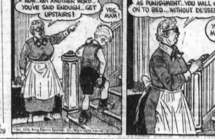
BY WALLY BISHOP