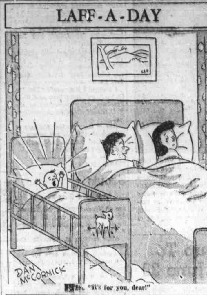
"TV's for you, dear!"

Six Passes to see "Caged" at the Strand Theatre showing Wednesday & Thursday, await some readers of The Mountaineer Want Ads. Look them over—See if your name appears in a Strand ad. If so, call at The Mountaineer office and get your passes.