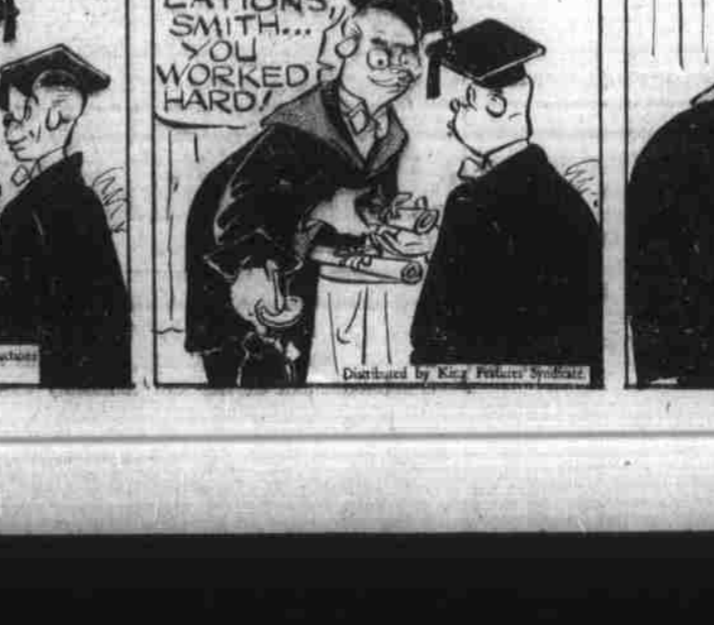
By WALT DISNEY

WANTED —Young lady cashier and floor girl. No experience necessary. References required. Esskay Galleries, 303 Main St. J 26-29