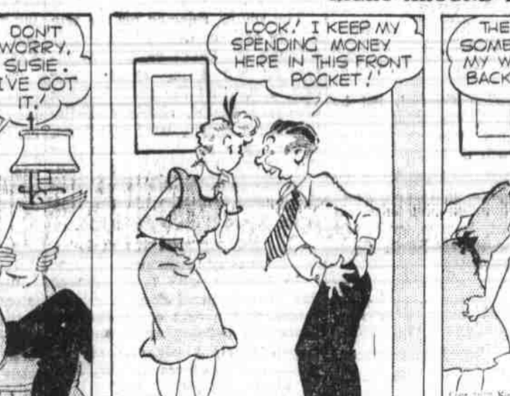
By DUDLEY FISHER