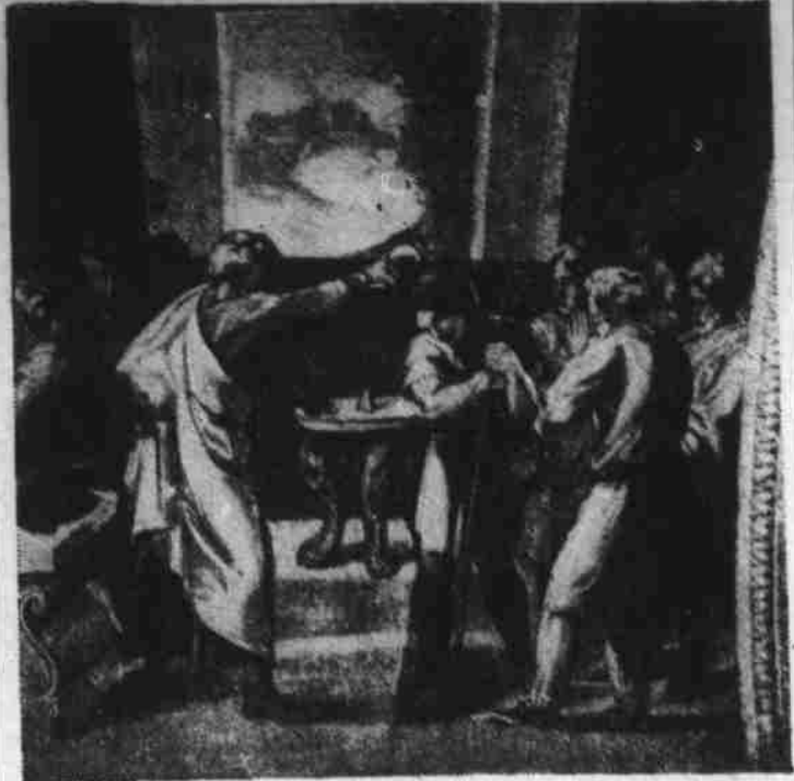
Samuel anointing David. "Thou art great, O Jehovah God: for there is none like Thee." —II Samuel 7:22.

And Nathan said to the king, "The Lord has taken away David's sin, and he shall build the Lord's house." The two beautiful Psalms David wrote should be read in class, but can not be quoted here. In Psalm 51, David pleads for forgiveness from his sins, and begs, "Create in me a clean heart, O God; and re- new a right spirit within me." So must we all pray to our Father who art in heaven. P. M. Preaching services—2:30 P. M.