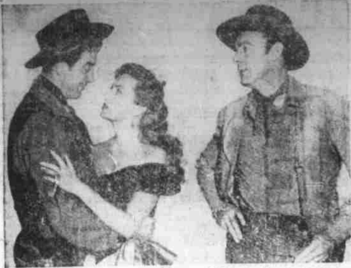
John Payne wins the affections of Rhonda Fleming in the technicolor production, "The Eagle and the Hawk," Dennis O'Keefe co-stars with the pair.