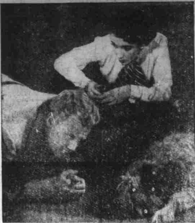
An amazed Elizabeth Taylor finds her boy friend, Van Johnson, suffering under the delusion that his dog is talking to him. It's one of the uproarious sequences from "The Big Hangover," coming to the Strand Theatre Sunday and Monday.