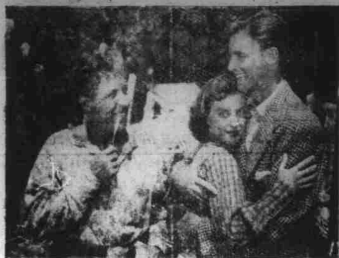
Jerome Courtland and Beverly Tyler in a scene from the technicolor outdoor drama "Palomino."