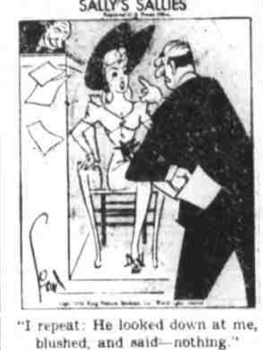
"I repeat: He looked down at me, blushed, and said—nothing."