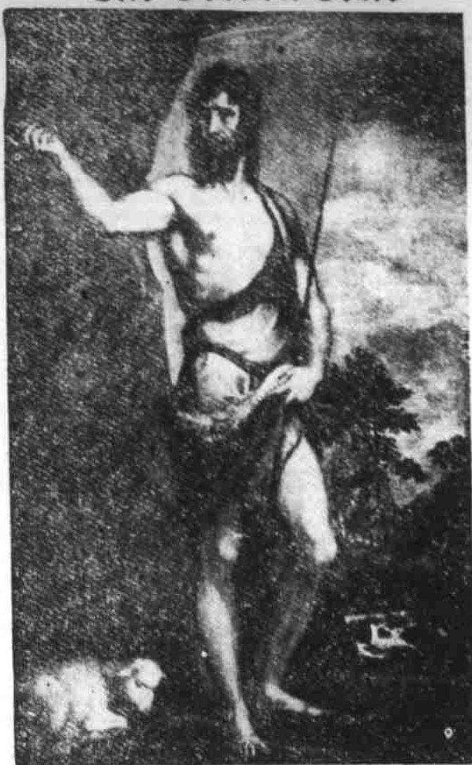
John the Baptist, preaching.

"Bring forth therefore fruits worthy of repentance."—Luke 3:8.