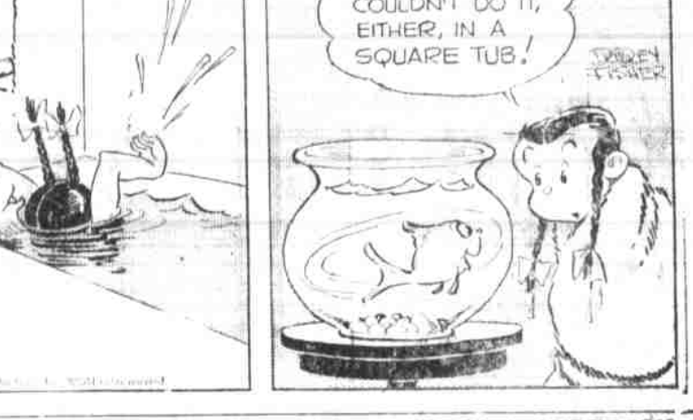
By DUDLEY FISHER