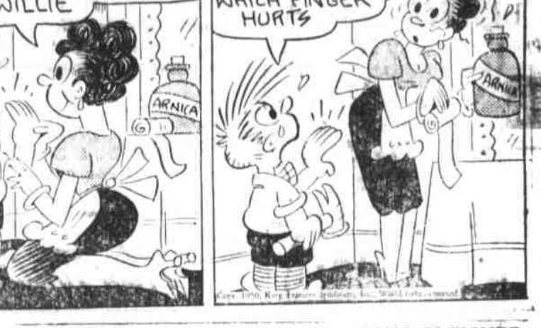
RIGHT AROUND HOME