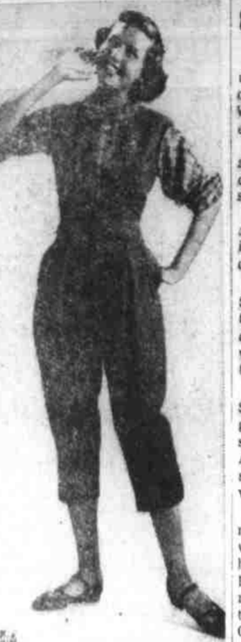
BIKE OUTFIT . . . Gray flannel pedal pushers are shown with matching weskit and plaid cotton shirt for sports wear. Substitute a skirt and it's a classroom costume.