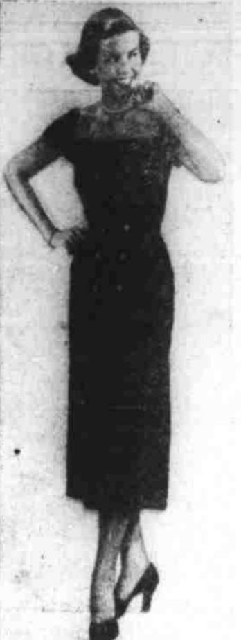
DATE BAIT . . . Black velvet skirt with rhinestone buttons is worn here with low-cut matching velvet blouse for a short formal outfit, may team with sleeved blouses.