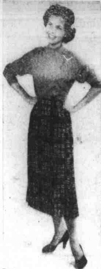
TARTAN TOUCH . . . The Scotch plaid wool skirt and matching beret team with a wool jersey blouse for a gay campus outfit, all items of which may be worn with other things.