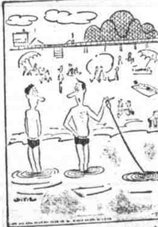
"What's so peculiar about it? Lots of people have pet goldfish."