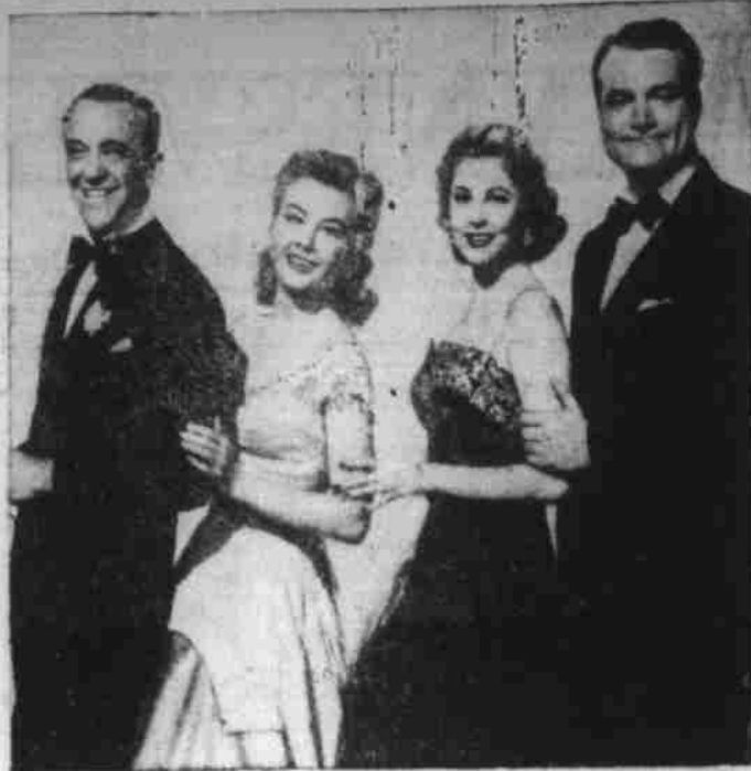
Fred Astaire, Vera-Ellen, Arlene Dahl and Red Skelton form the happy-go-lucky quartet of "Three Little Words," M-G-M's star-packed Technicolor musical based on the lives and music of Bert Kalmar and Harry Ruby, who gave America some of its most beloved popular songs. Opening at Strand Theatre with a late show. Also playing Sunday, Monday and Tuesday.