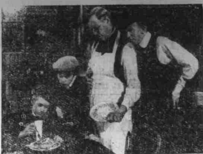
Dean Stockwell, Scotty Beckett and Daryl Hickman portray school boys in the technicolor production "The Happy Years."

A colorimeter is an instrument used to analyze substances through colors produced in chemical reactions.