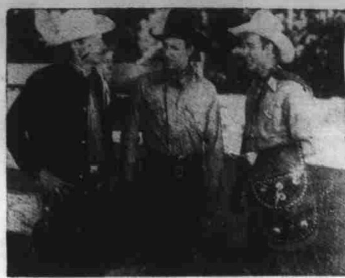
Roy Rogers, king of the cowboys, in a scene from his latest picture, "Trigger, Jr."