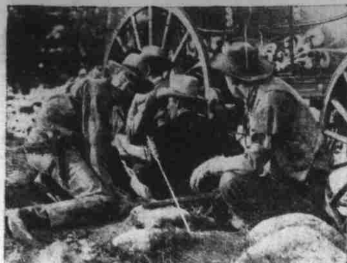
James Stewart helps stand off an Indian raid in this scene from the technicolor western "Broken Arrow."