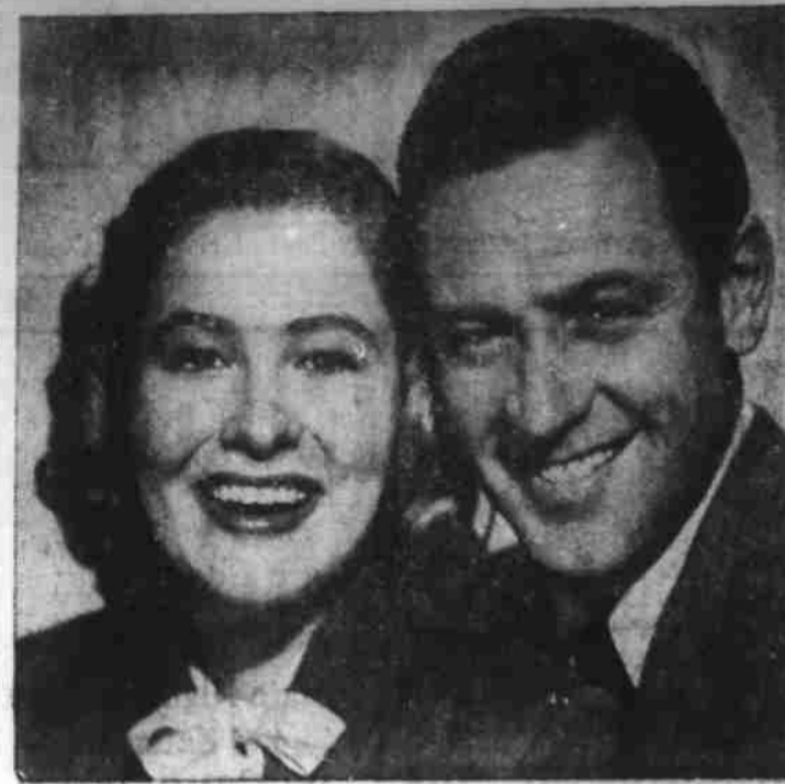
William Holden and Nancy Olsen starring in "Union Station" opening with a late show Saturday night. Also showing Sunday, Monday, and Tuesday.