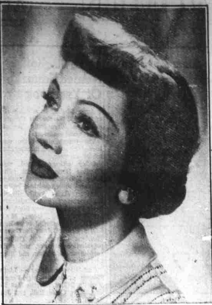
Claudette Colbert starring in "The Secret Fury" coming to the Strand Theatre Wednesday and Thursday.

NOTICE OF SUMMONS BY PUBLICATION IN THE SUPERIOR COURT BEFORE THE CLERK NORTH CAROLINA HAYWOOD COUNTY