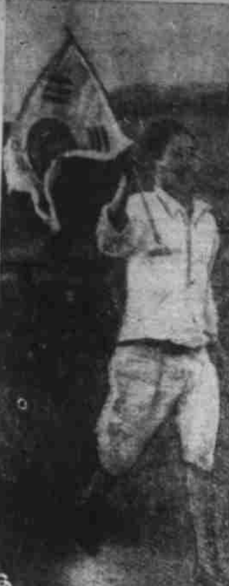
WAVING a flag, a Korean civilian runs to welcome units of the U. S. First Cavalry as they enter Taejon after its recapture by United Nations forces following the Inchon invasion.