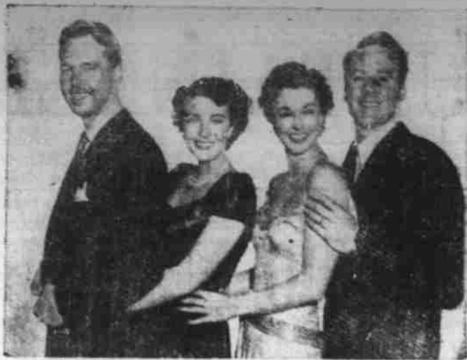
John Lund, Paula Raymond and stars Esther Williams and Van Johnson in a scene from the technicolor musical "Duchess Of Idaho."