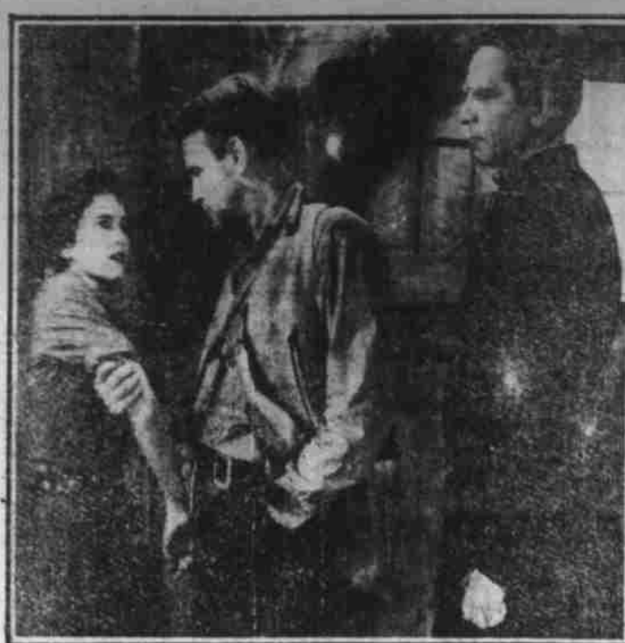
Teresa Wright and Lew Ayres starring in "The Capture" coming to the Strand Theatre Wednesday and Thursday.