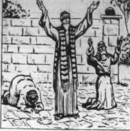
When they prayest, said Jesus, do not be as the hypocrites are, for they love to pray standing in the synagogues and standing in the streets, that they may be seen of men.

Scripture—Matthew 6:5-15; Luke 11:1-13; Philippians 1:3-11; Colossians 4:2-4.