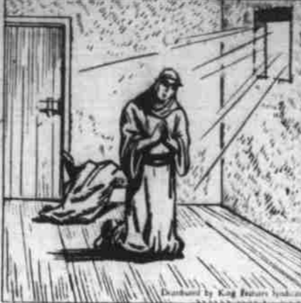
"But when thou prayest, enter into thy closet, and when thou hast shut thy door, pray to thy Father which is in secret and they Father shall reward thee openly."