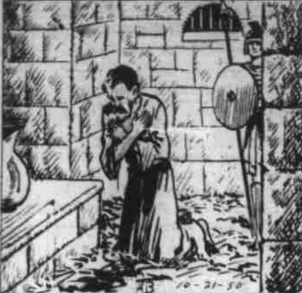
Paul, in his prison in Rome, prayed continually for the disciples—members of the various scattered churches established by him and others in certain cities. MEMORY VERSE—Luke 11:9.