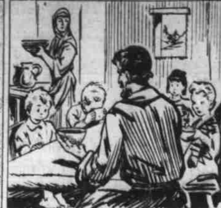
"If ye, being evil, know how to give good gifts unto your children: how much more shall your Heavenly Father give the Holy Spirit to them that ask Him?"