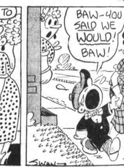
RIGHT AROUND HOME