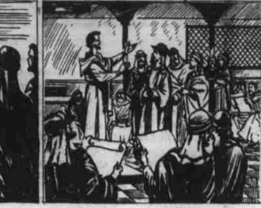
Jealous Jews in Thessalonica had cre-In Berea the Jews were more noble than ated an uproar when Paul and Silas those in Thessalonica, and received the preached in the synagogue, so the brethword with readiness of mind, and ren sent them to Berea at night. searched the scriptures daily.