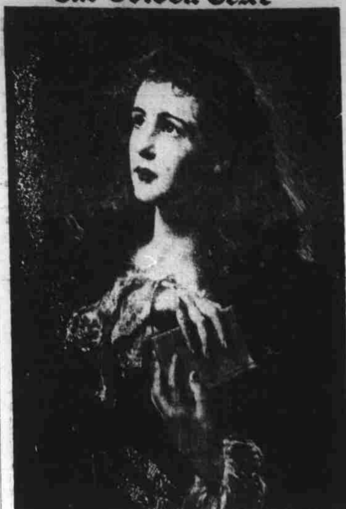
The soul's awakening. "Whatever things are true, whatever things are honorable, whatever things are just, whatever things are pure, whatever things are lovely, whatever things are of good report: if there be any virtue, and if there be any praise, think on these things."—Philippians 4:8.