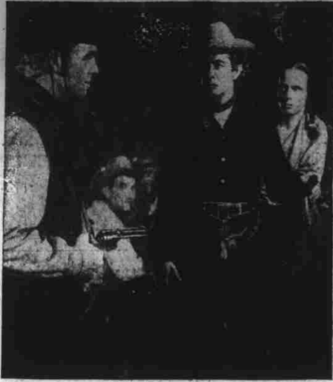
James Millican has the advantage of unarmed Robert Taylor in a tense scene from "Devil's Doorway", coming to the Strand Theatre Sunday, Monday and Tuesday.