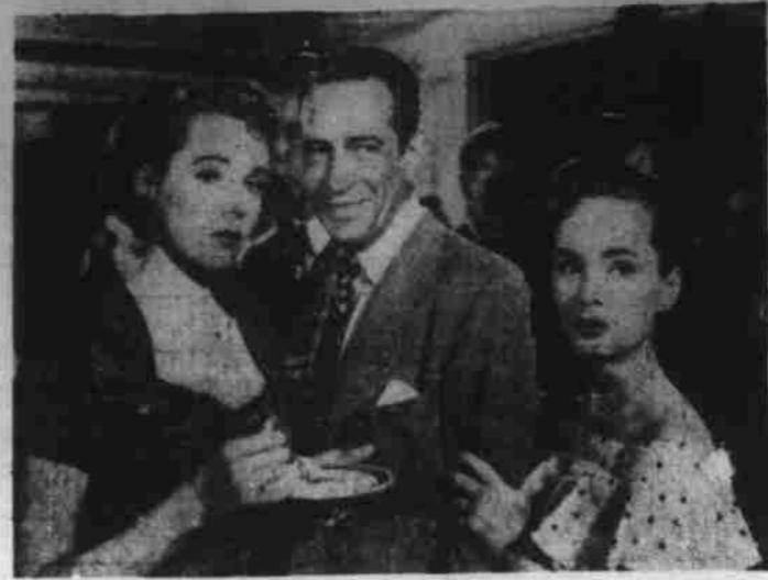
Ann Blyth with her screen parents Jane Wyatt and Donald Cook in a scene from "Our Very Own" which also stars Farley Granger and Joan Evans.