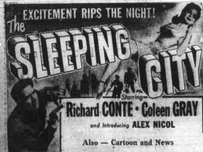
EXCITEMENT RIPS THE NIGHT! The SLEEPING CITY Starring Richard CONTE • Coleen GRAY and introducing ALEX NICOL Also—Cartoon and News BE WISE—GET STRAND WISE