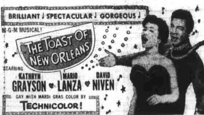
BRILLIANT • SPECTACULAR • GORGEOUS! M-G-M MUSICAL! THE TOAST OF NEW ORLEANS STARRING KATHY GRAYSON • MARIO LANZA • DAVID NIVEN GAY WITH MARI GRAS COLOR BY TECHNICOLOR!