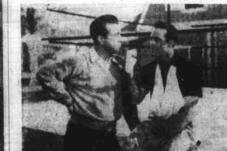
Ricardo Montalban, promising fighter, shows an injured fist to Dick Powell in this scene from "Right Cross," which also stars June Allyson.