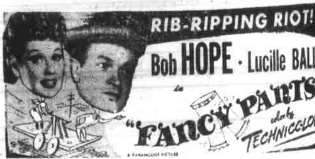
RIB-RIPPING RIOT! Bob HOPE • Lucille BALL "FANCY PARTS" color by TECHNICOLOR