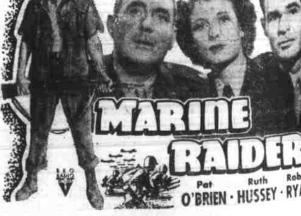
Action TO MATCH TODAY'S HEADLINES! MARINE RAIDERS Pat O'BRIEN • Ruth HUSSEY • Robert RYAN