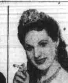
NADINE CONNER Opera's celebrated soprano