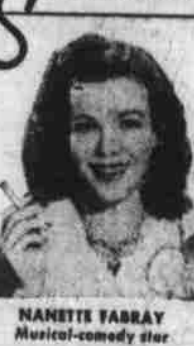
NANETTE FABRAY Musical-comedy star