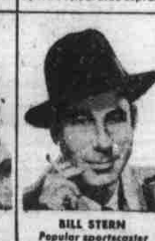
BILL STERN Popular sportscaster