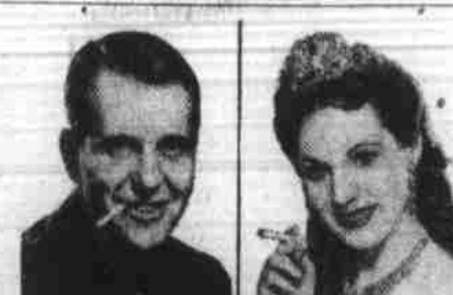
RALPH BELLAMY Stage and screen star