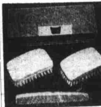
TOP OF THE PACK . . . Military brushes and comb in natural bristles.