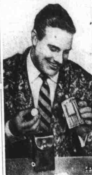
YULE SCENTS . . . Royal fern scent in after-shave lotion makes a hit.

Older members of the family who can afford to splurge will find available such interesting items as good grooming kits containing essential toilet articles, military brush sets and electric razors.