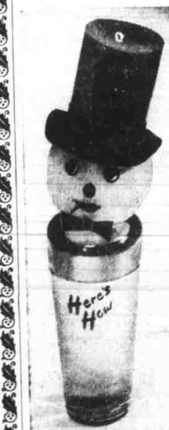
HERE'S HOW . . . Miniature cocktail shaker of after-shave lotion or cologne.

The National Geographic Society says the best estimate of Tibet's population is about 3,000,000.