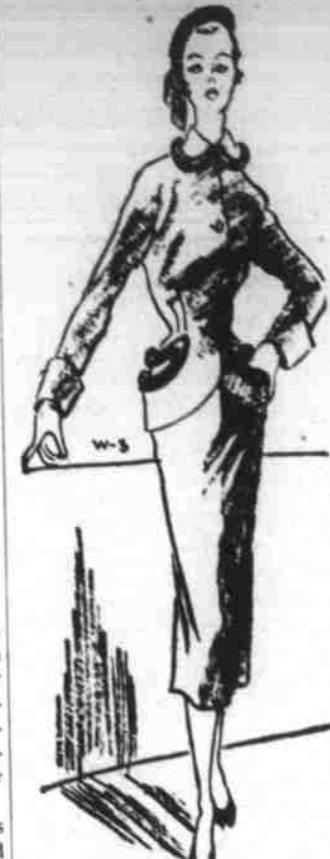
Elegant beige outfit.