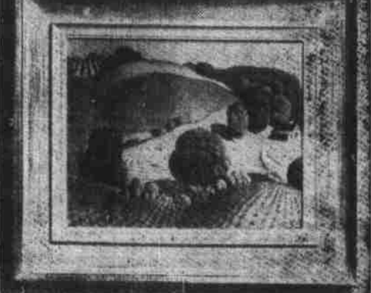
LITTLE DARLING . . . Thumb-sucking baby doll, modeled life-size from a newborn baby, drinks milk from magic bottle.