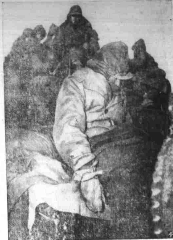
RETURNING: Pound to Chinese Red hordes near Manchuria, half-taken and weary soldiers slowly make their way south.