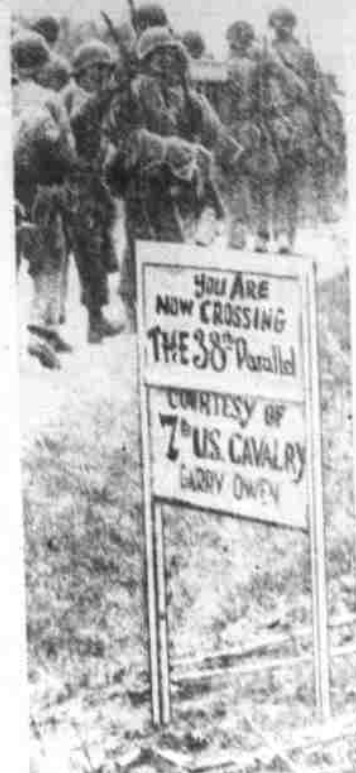
WINNING: Sensing victory, GIs cross 38th Parallel.