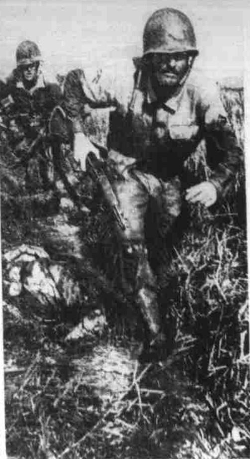
ATTACKING: A Marine corporal sloughs through mud in offensive against the enemy.