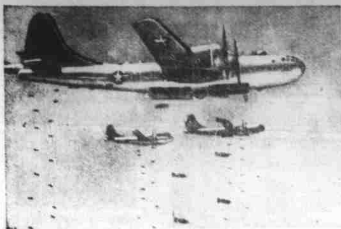
BOMBING: B-29 Superforts blast North Korean industries.