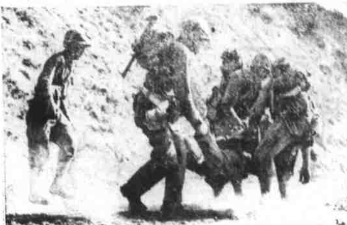
FIRST AIDING: Allied casualties treated as the offensive went on. Here hospital corpsmen rush wounded GI to safety.