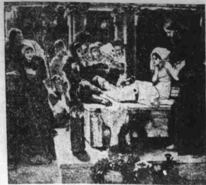
Raising the daughter of Jairus. "Fear not, only believe."—Mark 5:36.