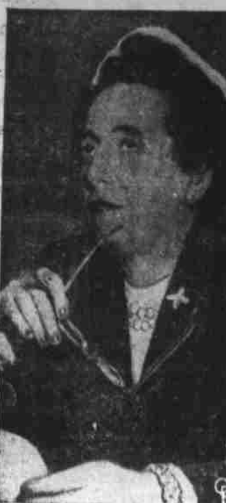
TESTIFYING in Washington before the House Armed Services Committee, Mrs. Anna M. Rosenberg, Assistant Defense Secretary for Manpower, reports that the Defense Department "does not recommend taking in veterans at this time." Mrs. Rosenberg took the stand during resumption of the committee's hearings on the Administration's universal military service and training bill, which calls for drafting of 18-year-olds

WASHINGTON — Mrs. Alben Barkley, who as wife of the Vice President, is one of the capital's busiest women, jets nothing interfere with her Tuesdays when Congress is in session, dedicating the day to a special task.