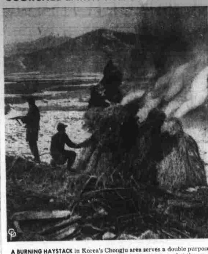
A BURNING HAYSTACK in Korea's Chongju area serves a double purpose. It destroys something that might be of aid to the enemy, and at the same time provides temporary warmth in below-zero weather. One GI is alerted against snipers while his buddy starts the fire.