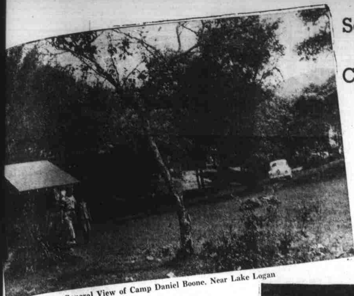
General View of Camp Daniel Boone. Near Lake Logan