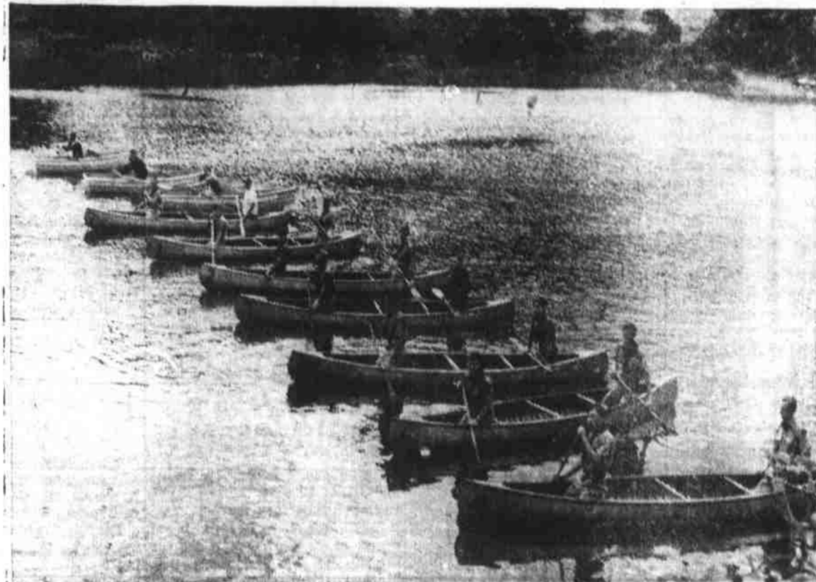
Scouts Stage Canoe Race on Lake at Camp Daniel Boone

The Scouts need the lake. A nation wide study of scout camps shows that the things Scouts like most about camp are swimming and canoeing and rowing. For about 4 of our Scouts, Camp Daniel Boone is the only place they can get these things.