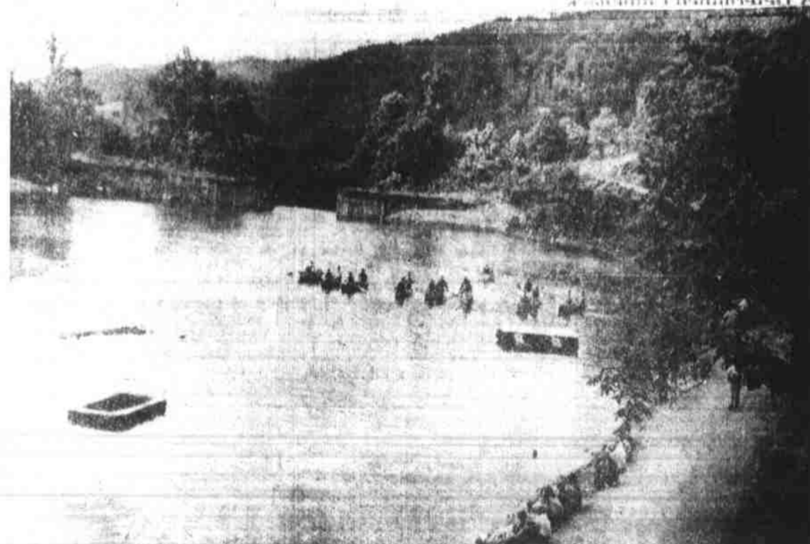
A general view of the Lake, with dam in the background

Today's Boys Plus Scouting Training Equals Tomorrow's Citizens and Leaders.