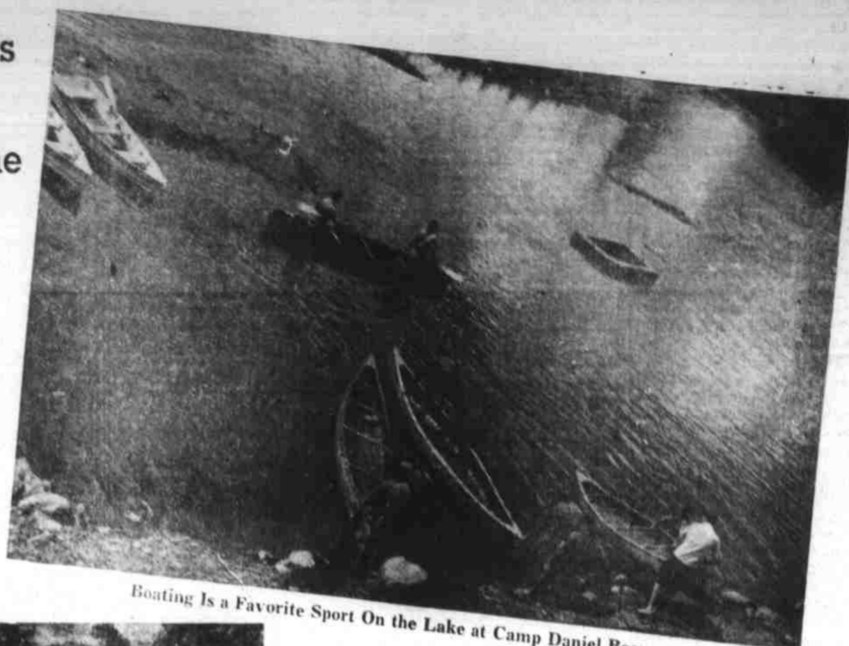
Boating Is a Favorite Sport On the Lake at Camp Daniel Boone

$25,000 For Repairing Damages Done By 1948 Floods