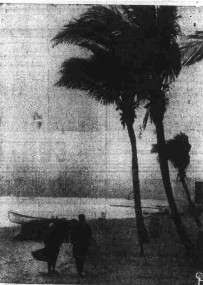
IMAGINE THE EMBARRASSMENT of the Chamber of Commerce when this couple appeared at the Miami Beach, Fla., surfside wearing their heavy coats. Chill blasts were bending the palm trees and a heavy surf was breaking. However, the cold spell was short lived and it will soon be Florida bathing beauties again, as usual.