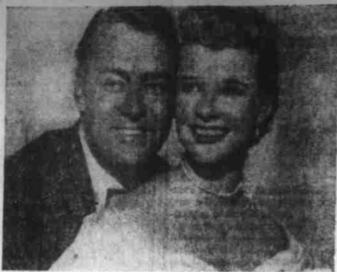
Alan Ladd and Mona Freeman in a scene from the technicolor western drama "Branded" which also stars Charles Bickford.