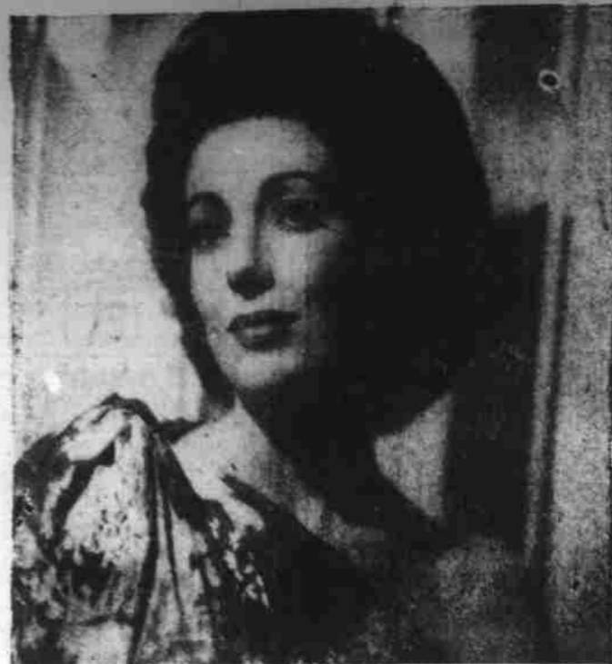
One of the films' most beautiful stars, lovely Loretta Young attains a new peak in a brilliant career with a compelling performance in Walter Wanger's Production, "Fury in the Sky."