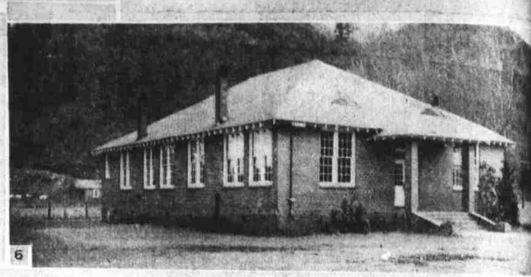
No. 5—A general view of the broad fertile valley of Allens Creek. This is looking towards Hazelwood. No. 6—This is the Allens Creek School, just about in the center of the community.