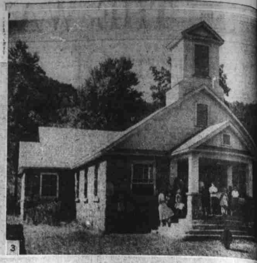
No. 3 — The Rocky Branch Baptist church, completed in 1950, and dedicated last fall. This is a modern rock structure, with a number of Sunday School rooms. The mortgage on the building was burned at the time of the dedication.