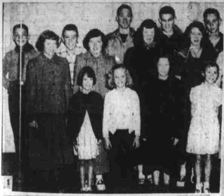
No. 1 and 4—A group of the young people of Allens Creek who are taking a keen interest in the program of making the community a better place to

ONE OF HAYWOOD'S 26 THRIVING COMMUNITIES PARTICIPATING IN THE COMMUNITY DEVELOPMENT PROGRAM